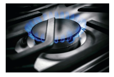
PowerPlus<sup>™</sup> Burner Boil, sear, and saute with power. The PowerPlus<sup>™</sup> Burner delivers a strong performance, every time with 18,200 BTU.